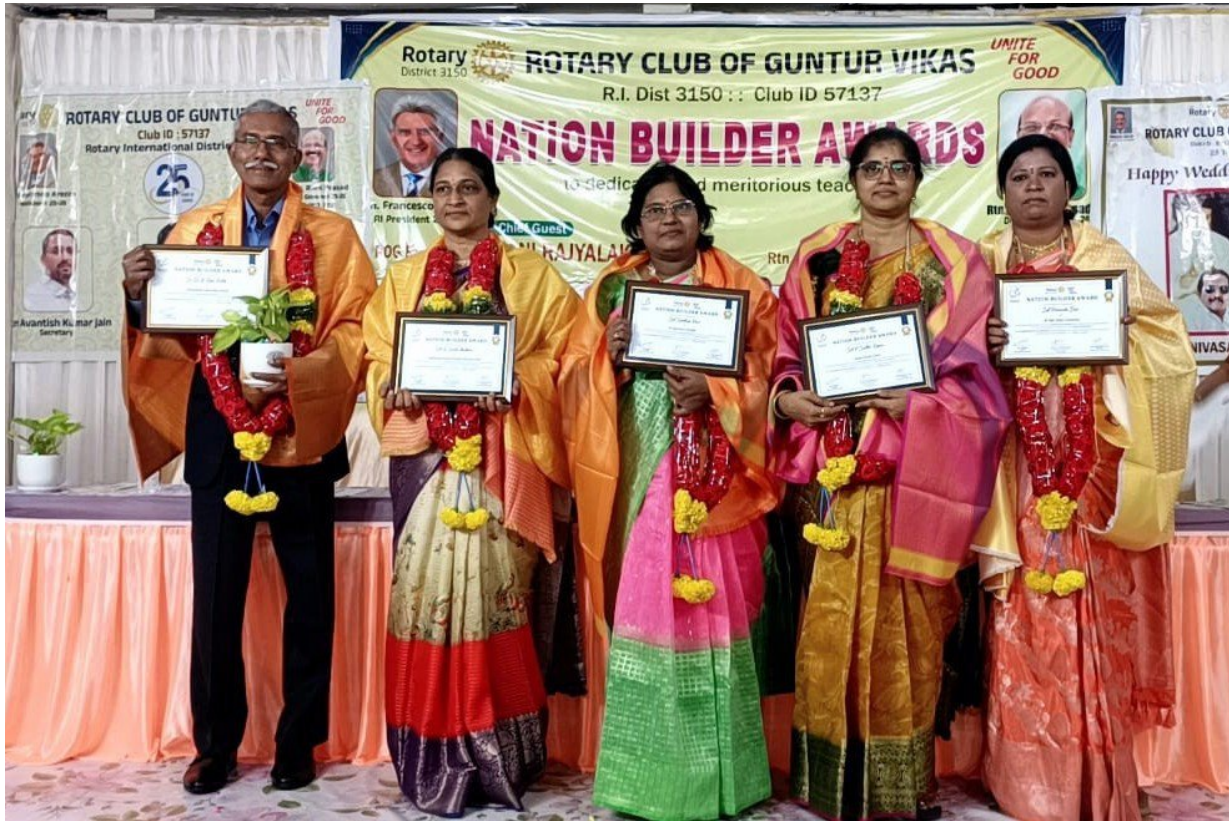
"Nation Builder" Awards winners group photo