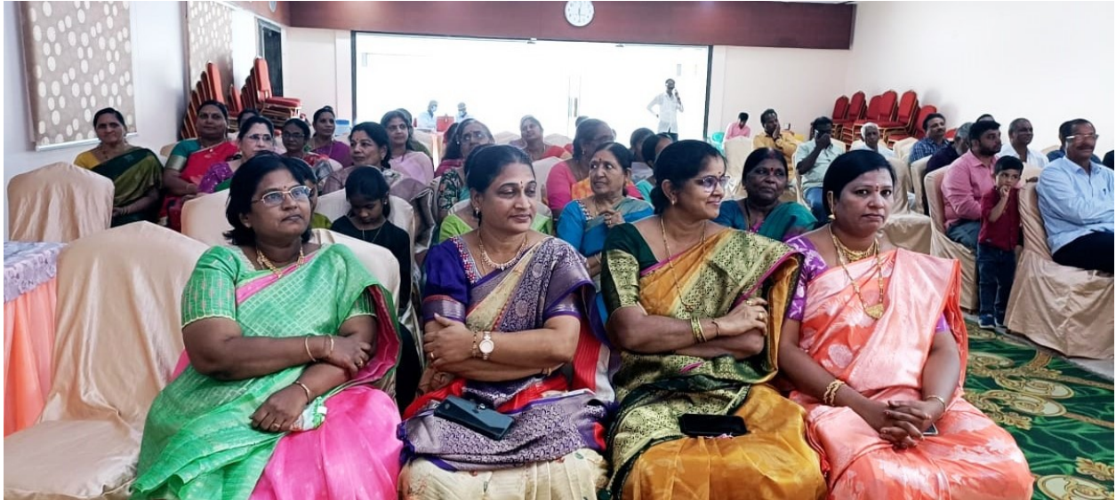
A section of audience